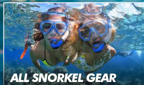
ALL SNORKEL GEAR