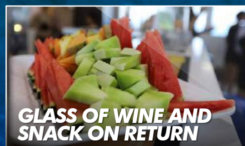
GLASS OF WINE AND SNACK ON RETURN