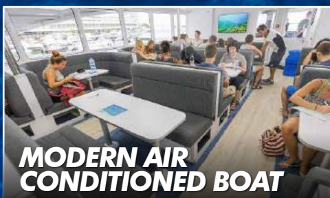
MODERN AIR CONDITIONED BOAT