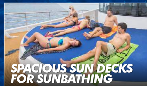
SPACIOUS SUN DECKS FOR SUNBATHING