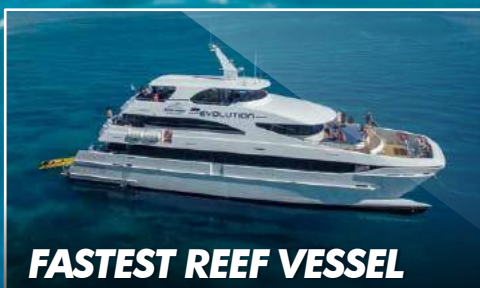
FASTEST REEF VESSEL