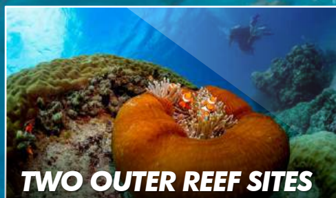
TWO OUTER REEF SITES