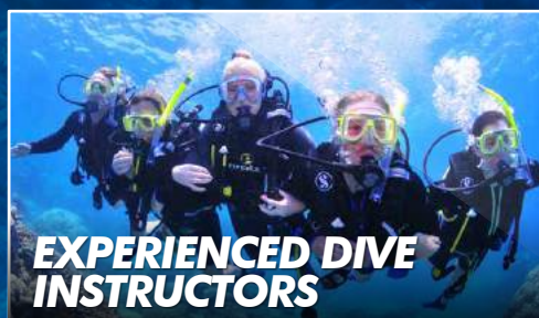
EXPERIENCED DIVE INSTRUCTORS