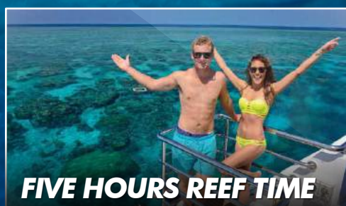
FIVE HOURS REEF TIME