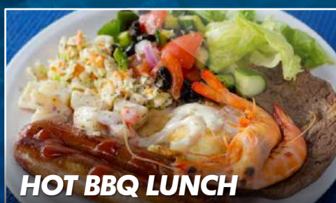
HOT BBQ LUNCH